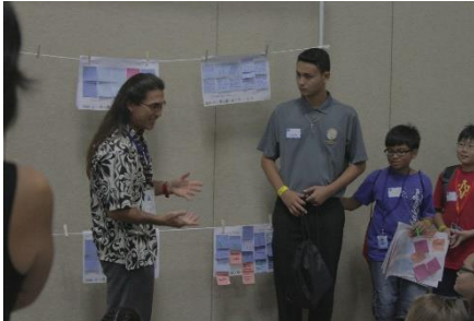
Design Thinking team sharing their storyboards