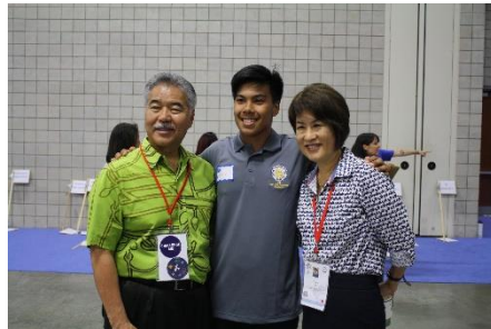
Hawai'i Governor David Ige and First Lady Dawn Ige with Waipahu High School student

A major goal of Students' Day was to inspire youth and give them a platform to connect with the IUCN Congress. A legacy initiative of the Congress and Students' Day is the Hawai'i Youth Sustainability Challenge, which aims to inspire youth to be intentionally engaged with the environment to become better stewards. Announced on Students' Day by First Lady Dawn Ige, this initiative will give students the opportunity to apply for micro-grants to implement their conservation ideas.