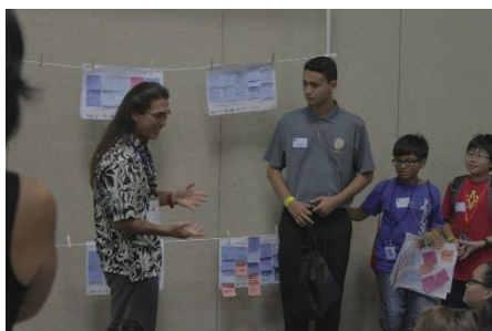
Design Thinking team sharing their storyboards