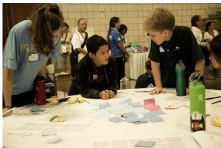
Student participants working together during the Design Thinking activity

Students' Day teams were composed of students from different schools, islands, and grades. This team structure allowed students to meet new people and learn different perspectives from their peers across the state.