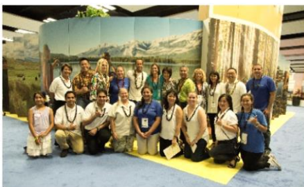
Students' Day Working Group and Speakers

As a joint community effort, this event gave Hawai'i students the opportunity to experience the global conference in a meaningful way. Students' Day was open to Hawai'i students 6 th – 12 th grade, with representation from public, private, charter, and home schools.